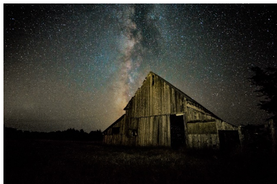
Stargazing on the Mendocino Coast

The Stargazing Family Package for four begins at $430, exclusive of tax and gratuity. More luxurious rooms are available for an additional price. Call (707) 937-5942 or (888) INNLOVE to book, or visit https://www.littleriverinn.com/little-river-inn-stargazing-family-fun-package/ . This experience must be booked at least five days in advance.