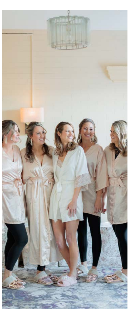
PORCH & EVERGREEN 1040 SQ FT