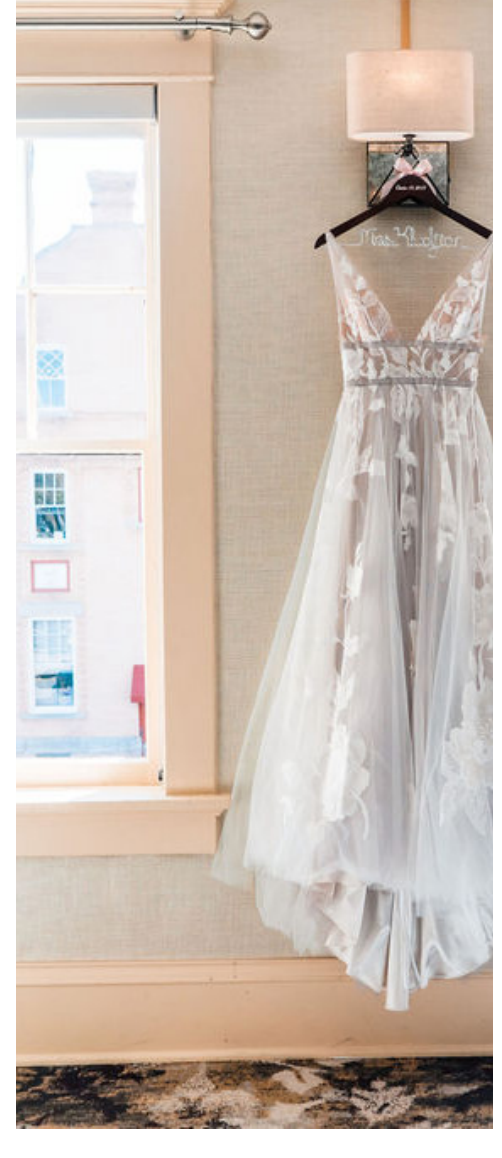
DRIFTWOOD 375 SQ FT