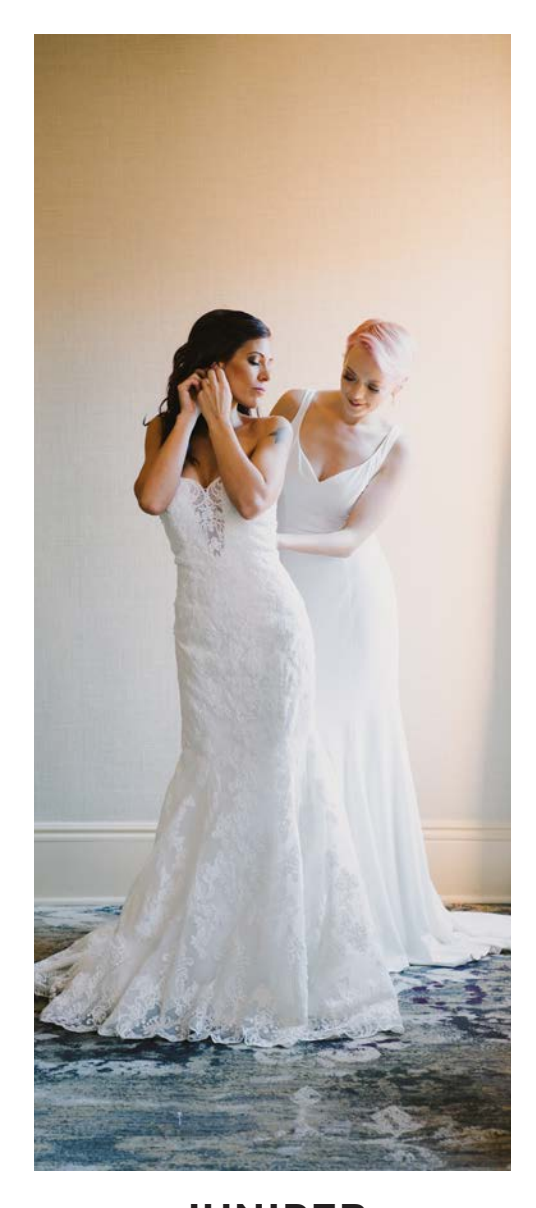
JUNIPER 493 SQ FT (PRIVATE PATIO)