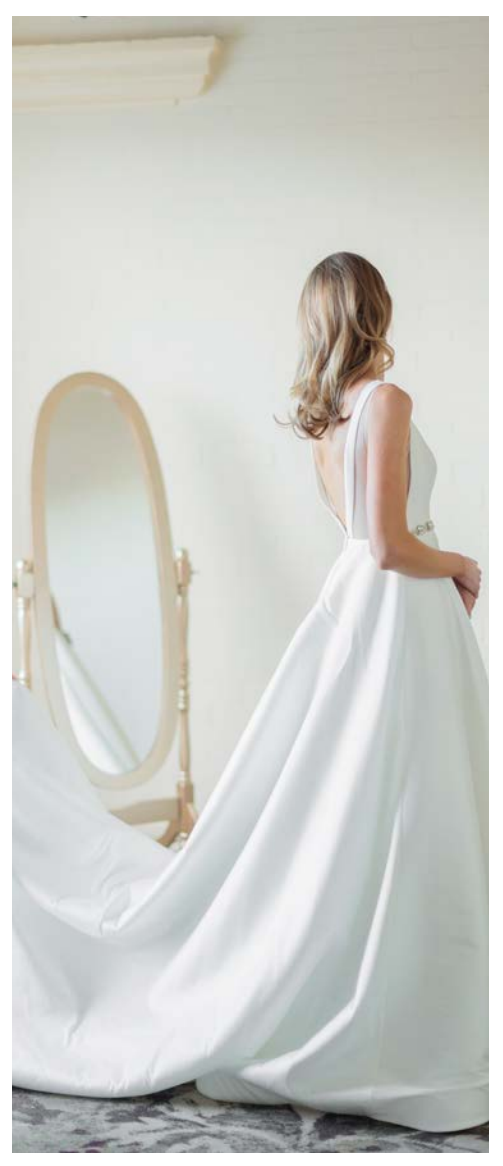
ASPEN 555 SQ FT